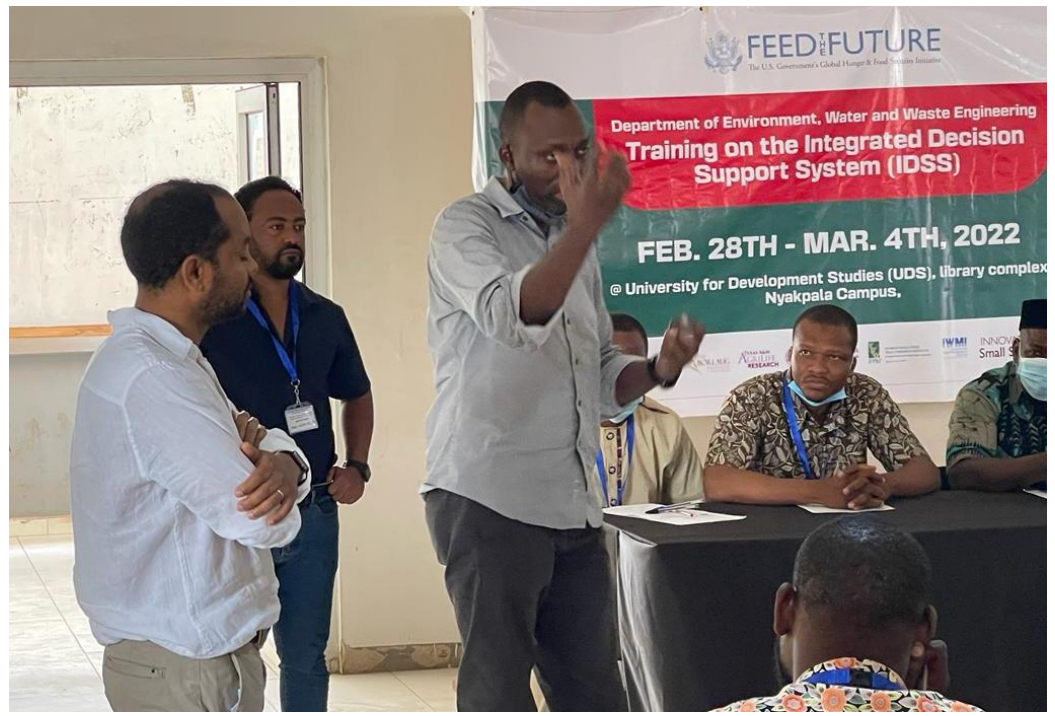
The IDSS team responding to questions after presenting a case study on the integration of the SWAT, FARMSIM and APEX models.

The opening ceremony was followed by an introduction to the research and local capacity development programs of the ILSSI IDSS team, an education on the theory and application of the three models and finally a demonstration of the integration of the models.