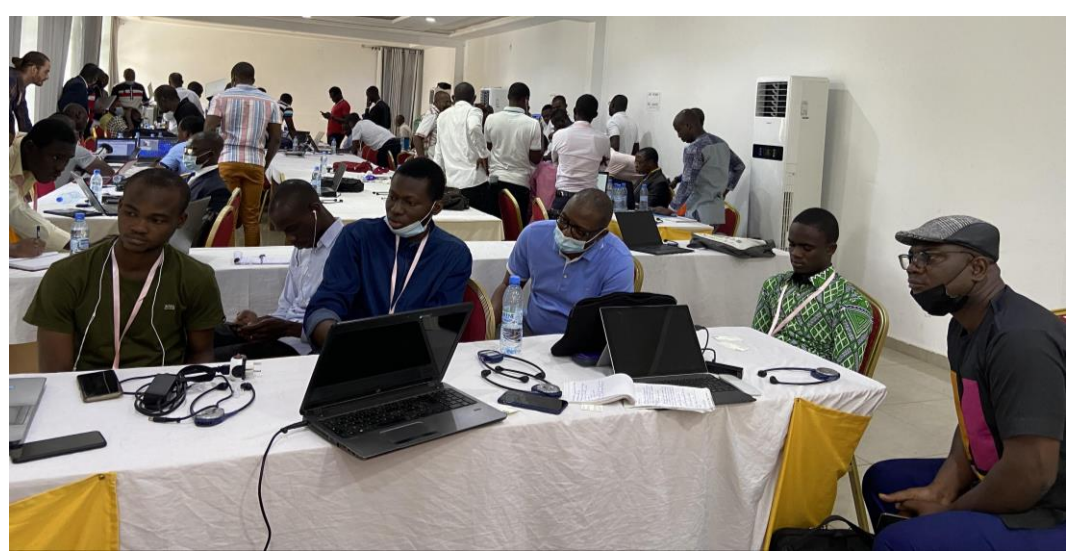
Group session on February 25 in Yamoussoukro showing participants practicing on the integration of the models.

On the final day of the workshop, participants from the different model classes came together and practiced the integration of the three models in groups. The groups were formed with at least one participant coming from one of the three model classes. The group practice aimed at enabling participants to exchange the knowledge and skills learned over the week, and to demonstrate how the IDSS integration works.