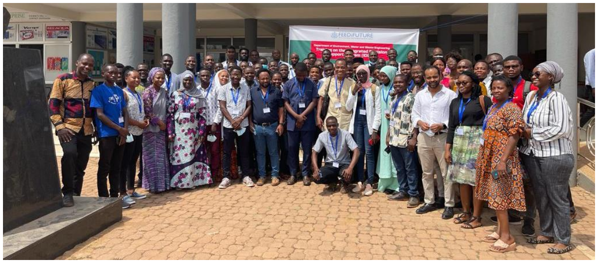
Group photo taken after the opening ceremony of the IDSS local capacity development in Nyankpala.

The opening ceremony was followed by an introduction to the research and local capacity development programs of the ILSSI IDSS team, an education on the theory and application of the three models and finally a demonstration of the integration of the models.